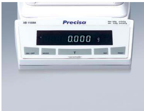
High-contrast vacuum fluorescent display