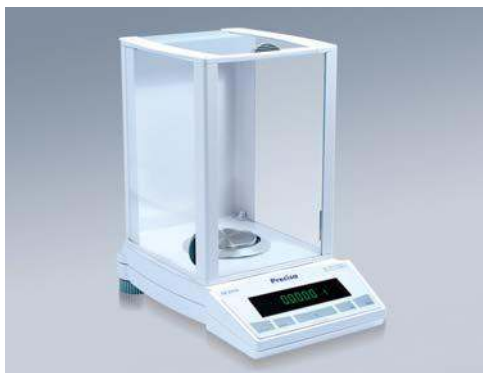
Easy operation draft shield