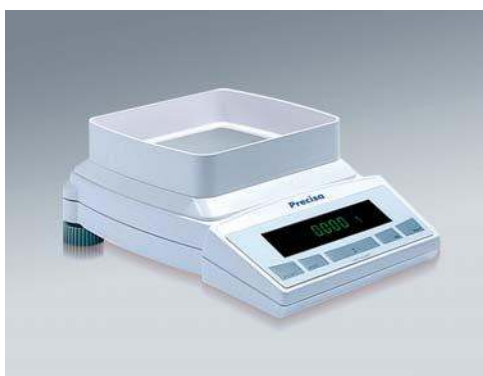
Basic draft shield for mg balances included