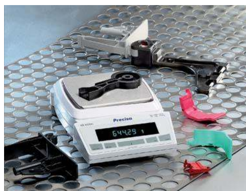
IP65 industrial protection as an option