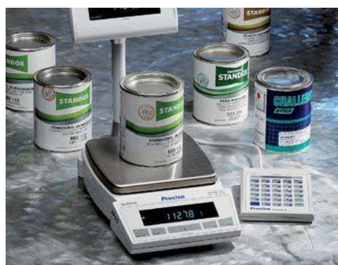
Various accessories for the simultaneous connection