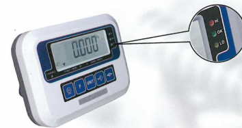
▲ LED Lo / OK / Hi indication