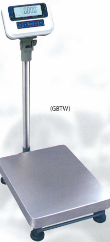
▲ Can be connected to most types of platforms